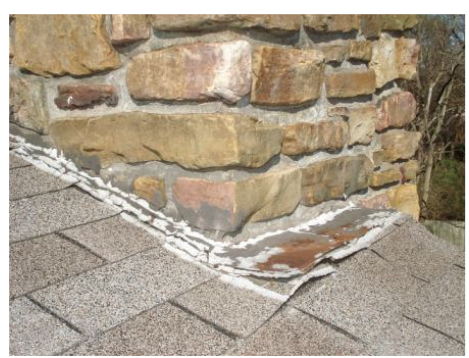
Figure 10: Chimney flashing pulled up from roof top.