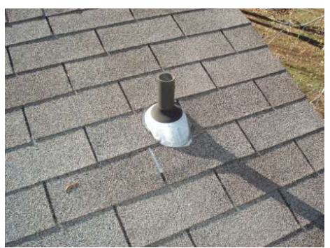
Figure 7: Plumbing flashing covered.