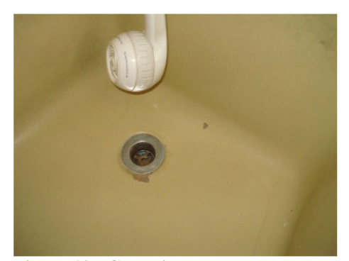
Figure 12: Crack in master tub near drain.