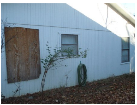
Figure 2: Siding and window damage.