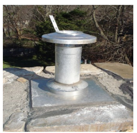
Figure 8: Spark arrestor/rain cap missing on chimney flue.