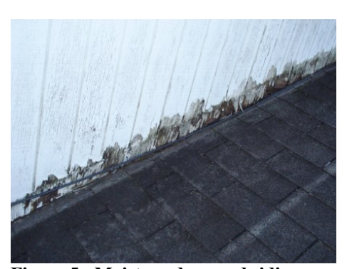
Figure 5: Moisture damaged siding, second level.