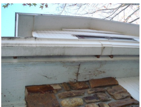
Figure 1: Noted moisture damage of soffit.