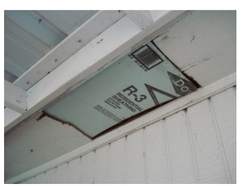
Figure 4: Soffit missing, east side.