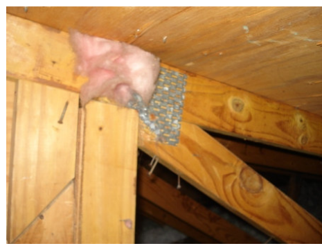
Figure 90: Connector plate of trus pulled back and web member missing.