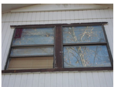
Figure 3: Broken window, second level west side.