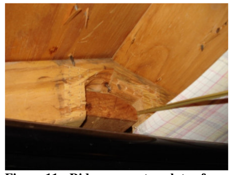
Figure 11: Ridge connector plate of truss missing.