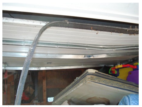
Figure 6: Inoperable garage door.