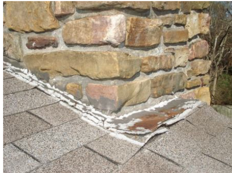
Figure 10: Chimney flashing pulled up from roof top.