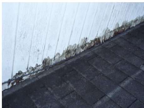
Figure 5: Moisture damaged siding, second level.