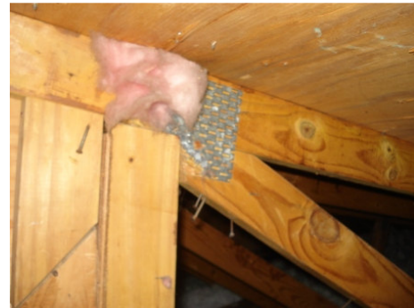
Figure 90: Connector plate of truss pulled back and web member missing.