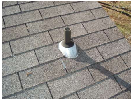
Figure 7: Plumbing flashing covered.