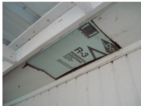
Figure 4: Soffit missing, east side.