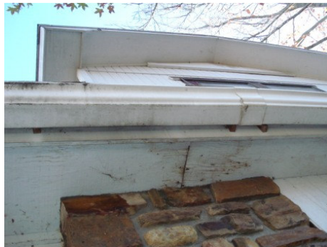
Figure 1: Noted moisture damage of soffit.