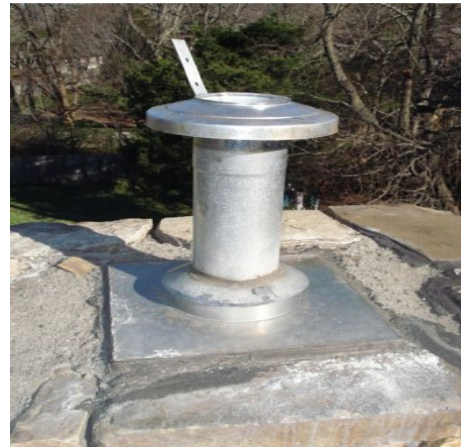
Figure 8: Spark arrestor/rain cap missing on chimney flue.