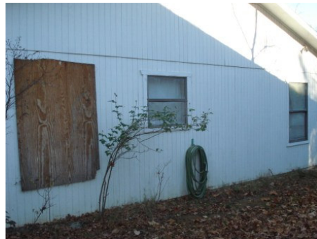
Figure 2: Siding and window damage.