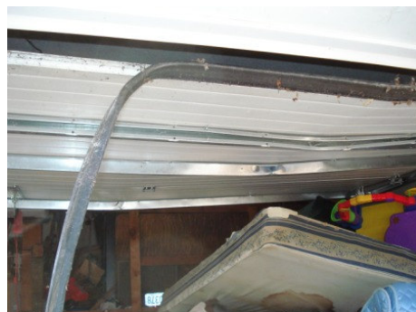
Figure 6: Inoperable garage door.