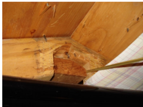
Figure 11: Ridge connector plate of truss missing.