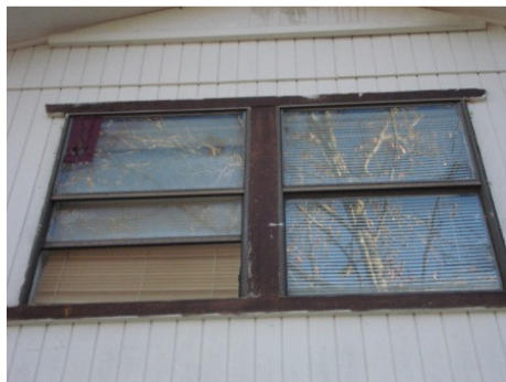
Figure 3: Broken window, second level west side.