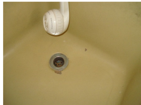
Figure 12: Crack in master tub near drain.